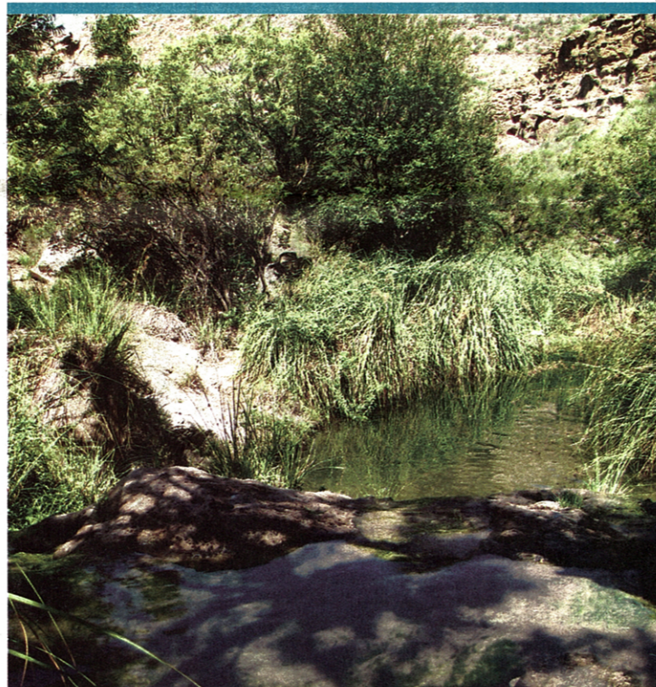
Cool lagoons and sparkling pools surround the area.

Another thing to keep in mind is that the area around Sitting Bull Falls is designated as "cougar country," not so much for the lipsticked variety as for the big cats who are natural residents of the area. Read the signs and heed their warnings, just as you would in any natural area, and everything should be fine. Prepare a picnic lunch in advance and spend the day enjoying one of the rare wonders of this enchanting state; a literal oasis of lush riparian vegetation