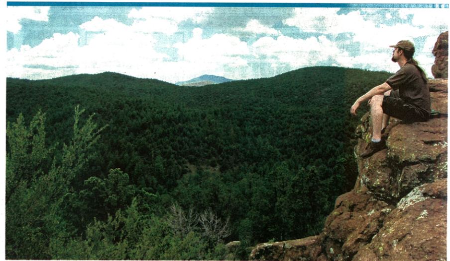
Hours of contemplation can be experienced on the edge of the mountain, overlooking the forest below.