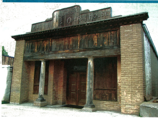
The historic Pinos Altos Opera House is a visual reminder that history still lives on the edge of the Gila National Forest.